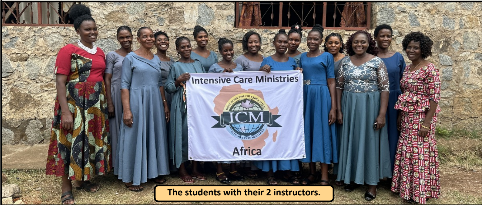
The students with their 2 instructors.

SHORT- AND LONG-TERM HELP NEEDED We are still praying for men to help us with pulpit supply for our English-speaking church for January and February, 2025, while we are in the USA. Maybe a husband-wife team who are comfortable/familiar with living in a 3 rd -world environment. Please contact us for more info.