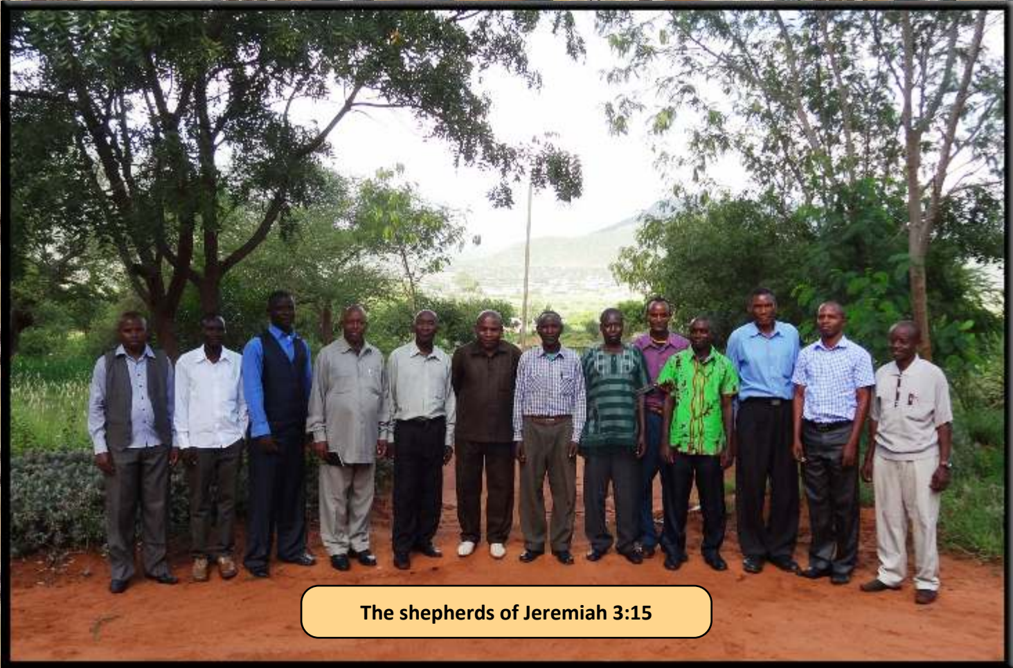
The shepherds of Jeremiah 3:15