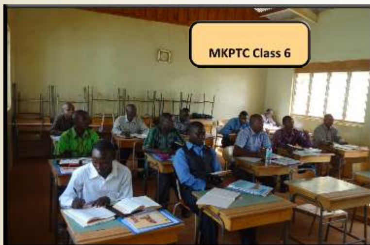
MKPTC Class 6

A critical component of the training is the practical expositional preaching exercises, for they represent the application of what we are trying to accomplish here – taking the IBS method and tools and using them to develop expositional sermons for preaching God's Word verse by verse. When Western instructors conduct the sessions, we have to be very careful in how we give the feedback to each student after he preaches his sermon. Too harsh...even if the feedback is true...and we risk offending not only the student, but the whole class as well.