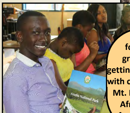
(L) Training for Life students on graduation day. Girls getting ready (top); students with certificates for climbing Mt. Meru; girls dressed in African attire during a fashion show (bottom)