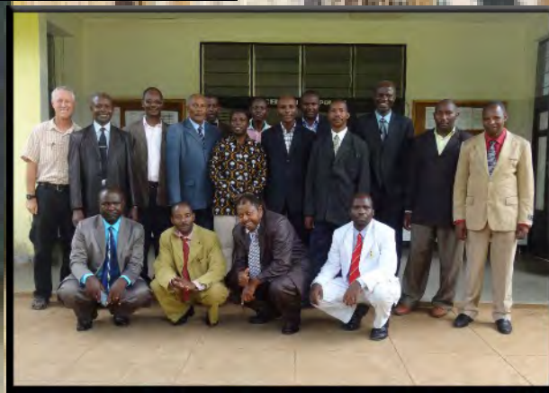
(Top) The teachers and students from the Women's Training Center Class; (Bottom Right) A new class of men going through the Training Center; (Bottom Left) The TFL university-bound students at their graduation.