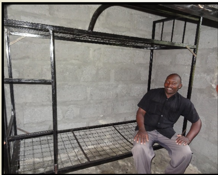
Above: Frame for 1 of 6 bunk beds

that many other ministries have come and gone among the Meru people with no lasting fruit. Then he said, "You know, truly ICM-TZ has the words of eternal life." It was so profound to hear that the words of John 6:68 have been etched on this man's heart, and that he felt they were the best words to show us what was deep inside him. He made sure we understood he was not comparing us to Jesus. He was simply saying that ICM-TZ is teaching a better way—not a way of our own thinking, but God's way as provided in His Word—a lasting way that honors and respects the dignity of the people here and empowers them to put forth sustaining work. To God alone be the glory!