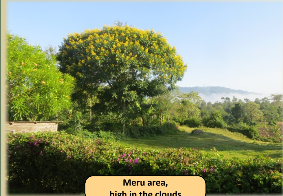
Meru area, high in the clouds

One thing you notice when someone develops a true passion for God's Word is their normal conversation becomes laced with words from Scripture. Bathing their mind in the Word begins to encompass every part of their life...their thoughts, actions, and words. We do not mean they quote chapter and verse from the Bible; that can be overwhelming to others. But the more you converse with them, you will hear phrases and ideas from the Bible as part of the conversation.