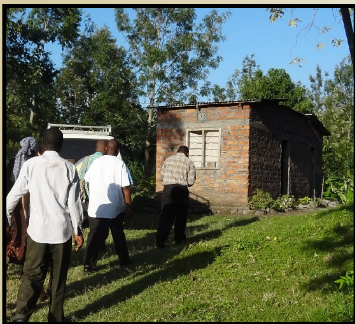
Bottom Right: Finished dormitory for students/teachers