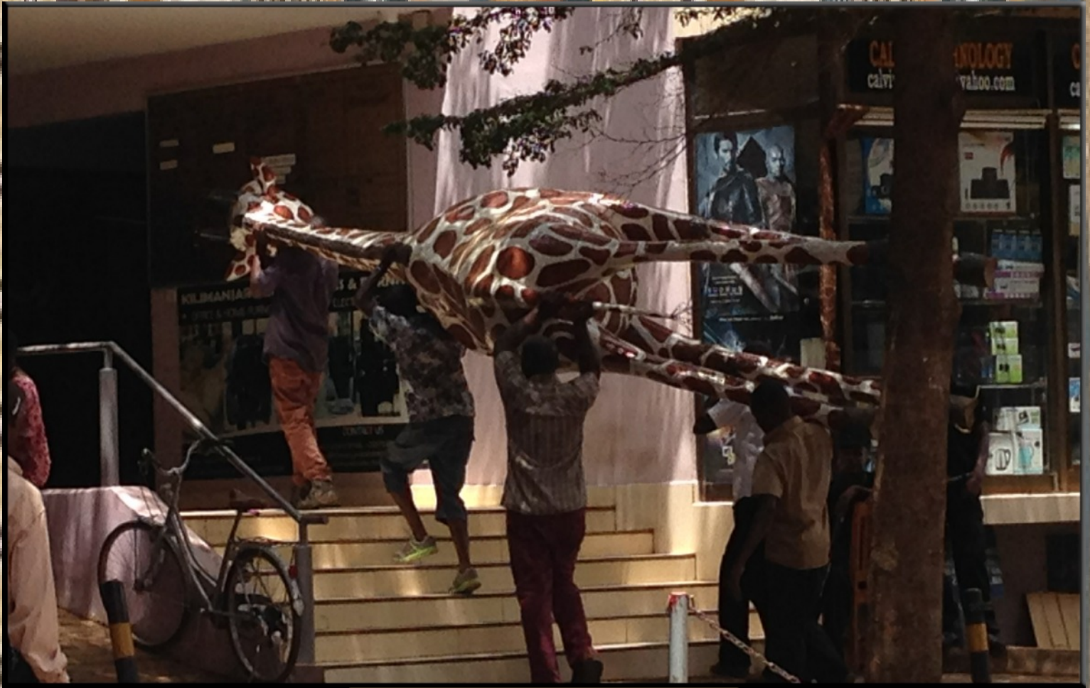
How to get a giraffe to go up stairs!