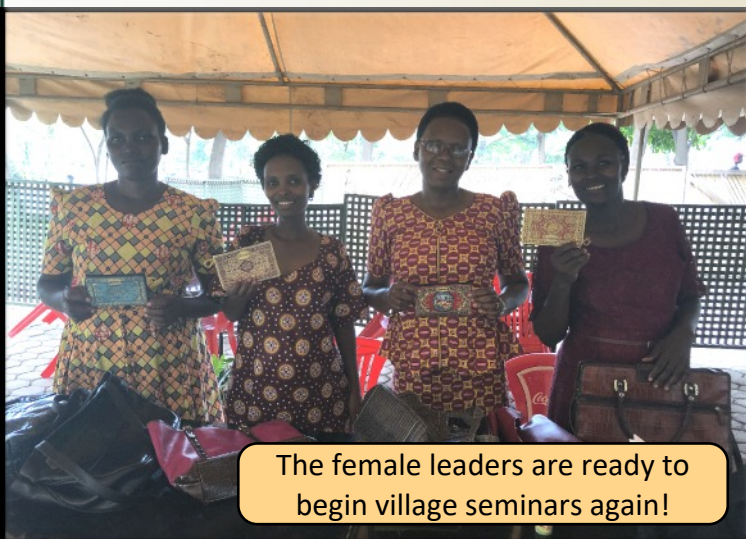
The female leaders are ready to begin village seminars again!

In addition, we will resume our IBS workshops and women's seminars in August with a similar approach: a slow, methodical, and gradual increase until we reach our previous capacity which was over 30 seminars per month. Again, we had already engaged in fruitful discussions with our leaders as to how we could operate in more cost-effective and efficient ways. It was like the Lord was preparing us for this time. Needless to say, we're all excited about finding a new normal and being productive in continuing to share God's Word!