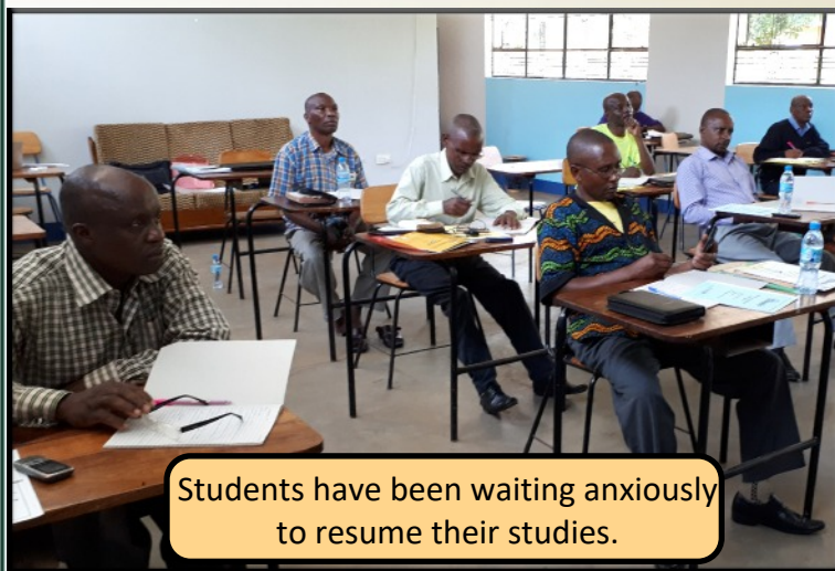
Students have been waiting anxiously to resume their studies.

In addition, we will resume our IBS workshops and women's seminars in August with a similar approach: a slow, methodical, and gradual increase until we reach our previous capacity which was over 30 seminars per month. Again, we had already engaged in fruitful discussions with our leaders as to how we could operate in more cost-effective and efficient ways. It was like the Lord was preparing us for this time. Needless to say, we're all excited about finding a new normal and being productive in continuing to share God's Word!