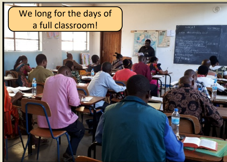
We long for the days of a full classroom!

us it is time to quit, but He may be wanting to redirect us. And we are having to trust there is also a good reason He has us in the US now rather than back in Africa, so pray for us to have patience to wait on His perfect timing and be fruitful where we're planted! So while we are waiting, we've begun giving updates at churches which are open. If you would like to host us to speak at your church, life group, or other function, please let us know.