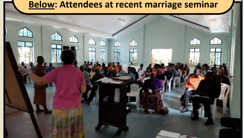
Below: Attendees at recent marriage seminar

Catch up on our personal journey through our website news, and find many more pictures there.