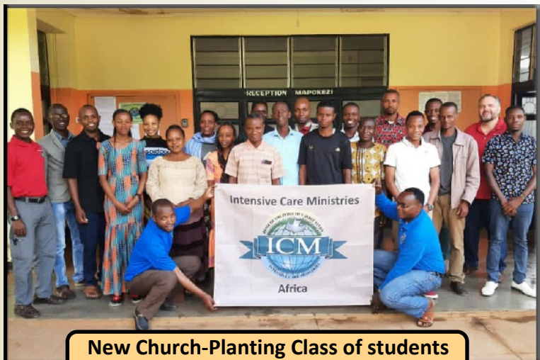
New Church-Planting Class of students

The Lord has also brought us an incredible group of students for the latest Certificate in Church Planting class in Moshi. These young men and women have a passion for Jesus and an unequalled willingness to deepen their knowledge of the Lord and His ways through rigorous Bible study and application of biblical truths. They are contagious to be around. We sat in the back of their class as they received the teaching, and we took meals with them. We even hung around after dinner to hear them preach during their practical preaching exercises. We saw confidence and composure in the Word, compassion for and a keen awareness of their audience, and great diligence in their sermon development work. They brought us the unexpected blessing of restoration!