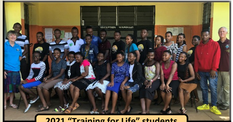
2021 "Training for Life" students

Working with youth has been a great blessing and often reinvigorated us over the past 10 years, but some years they have also provided us a great challenge. For 3.5 months we would labor among these precious 17/18-year-olds, hoping they would receive God's Word. But sometimes their obstinance, disrespect, and lack of enthusiasm for spiritual things would sap our energy and leave us feeling empty. Last month the Lord brought us a