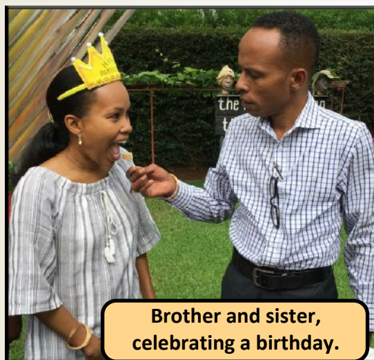
Brother and sister, celebrating a birthday.

for Jesus. He faithfully attended church, sitting on the front row every week with his Bible open and a notebook and pen hard at work. Later he became an elder and did the public reading of Scriptures each week.