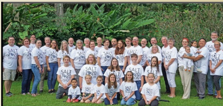
Below: Our annual gathering of missionaries serving in Tanzania, many of whom left this year.

Catch up on our personal journey through our website news, and find many more pictures there.