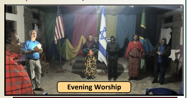
"The LORD is good to those who wait for Him, to the soul who seeks Him." Lamentations 3:25

seemed to have the same simple, straightforward goal: thank the Lord in a corporate setting for His faithfulness to the ministry and for His mercy and grace in bringing us all back together. As a result, the conference had the excitement and feel of a long-awaited family reunion. Stories were shared, relationships were renewed and strengthened, and hearts were refreshed as we poured out our thanks, gratitude and praises to the Lord each evening in some of the most amazing Christ-centered worship we have ever experienced.