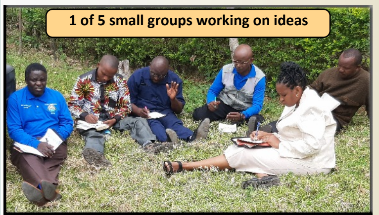
"A man's heart plans his way, but the Lord directs his steps." Proverbs 16:9

each team to present their applications. This is where the seeds of future ministry transformation were sown!