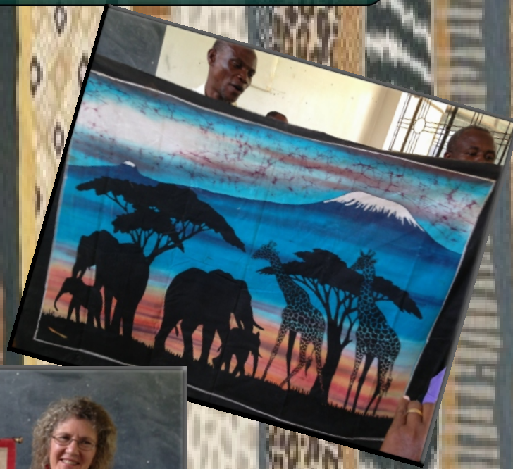
ABOVE: Another gift from the team—fabric for a wall hanging!