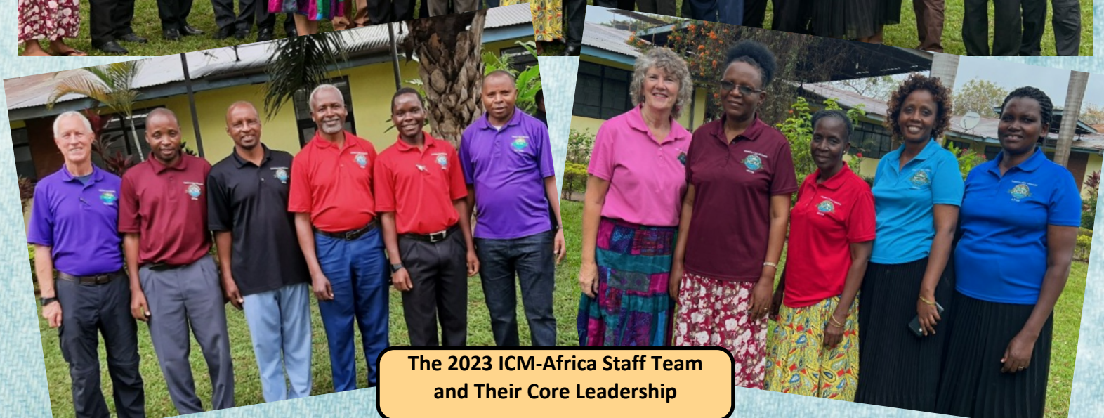
The 2023 ICM-Africa Staff Team and Their Core Leadership