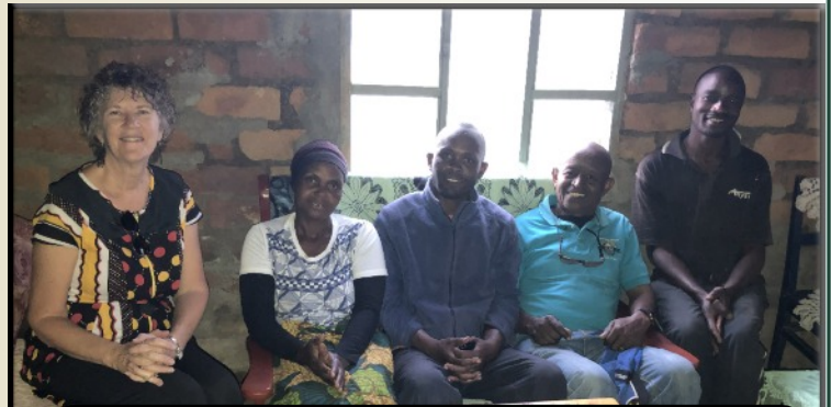
Top: This woman is a widow whose husband died during the construction of the campus. She is now employed as a cook.

While at our Meru campus, we had the privilege to get out and walk through the mountain village and visit several of the families who work at the ICM facility. One is a teacher, two are cooks, one handles all the cleaning, and another is the groundskeeper. Prior to the ICM school being built there, these families struggled for their daily existence of food and adequate shelter. Now, they were all proud to show us how ICM has provided the means for them to enlarge their homes, build outdoor toilets, and have plenty of food. And each family provided us a meal to show their gratitude. We ate 5 meals in about a 3-hour time span!!! One even gifted us with a live rooster which we could prepare after returning home. I had to tell them that I had no idea how to kill or butcher the poor thing, so they did it for me and sent us home with the meat.