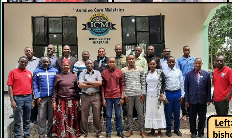
Left: Fredy's wife and new child; presenting the ICM gift to the bishop; and with students at the new classroom.