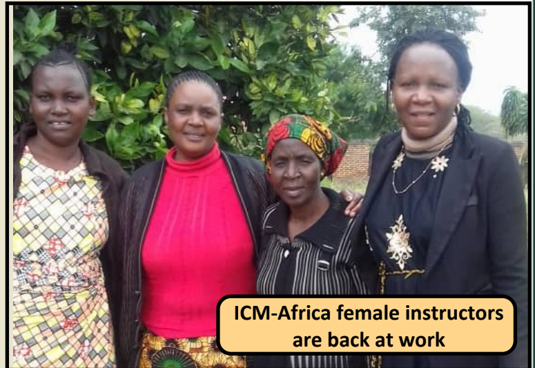
ICM-Africa female instructors are back at work

"Gracious is the LORD, and righteous; Yes, our God is merciful." Psalm 116:5