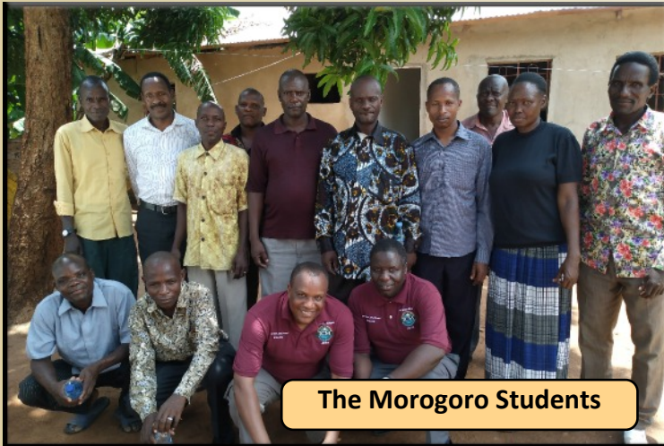
The Morogoro Students

We thank the Lord for His perfect wisdom in encouraging and challenging our ministers in Tanzania to examine and implement cost-saving measures for the Bible Colleges and return them to a full operating schedule in our absence. Even as we write this, we have three of the campuses operating at the same time for the 30-month diploma program, and similar schedules continuing into December! God's work, done His way and for His glory, always continues (1 Cor 15:58).