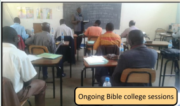
Ongoing Bible college sessions

We are thankful the Lord heard and responded to the prayers of His saints in the U.S. on our behalf. Not the answer we expected, but certainly what we needed! The ICM-TZ team continues to amaze and bless us with their ability to not only carry on, but thrive when we are not there to direct and guide them in all they do. It is a reminder that this is a work of the Lord—not us—and will be