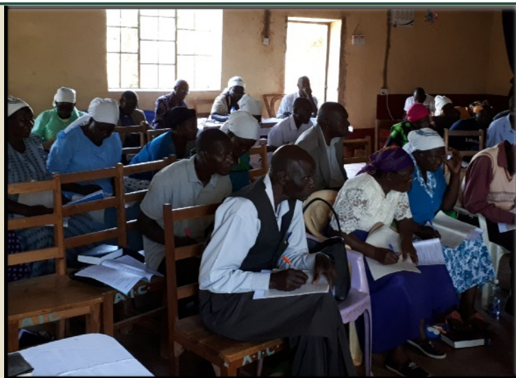
Many pastors/leaders from one denomination