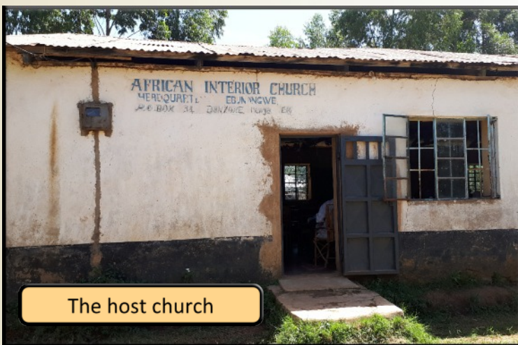
The host church

Early this year we were invited to west Kenya to conduct a preaching seminar to almost 30 pastors. We were excited to have this many pastors as we usually expect 15-20. A long day's journey from Nairobi had us arriving in a remote area after dark, not far from our seminar location. After a good night's rest, we went through our normal morning routine; then arrived at the host church by 8:30. Seven pastors were already there, including the host. Another 30 minutes and we had 15 pastors. Excellent!