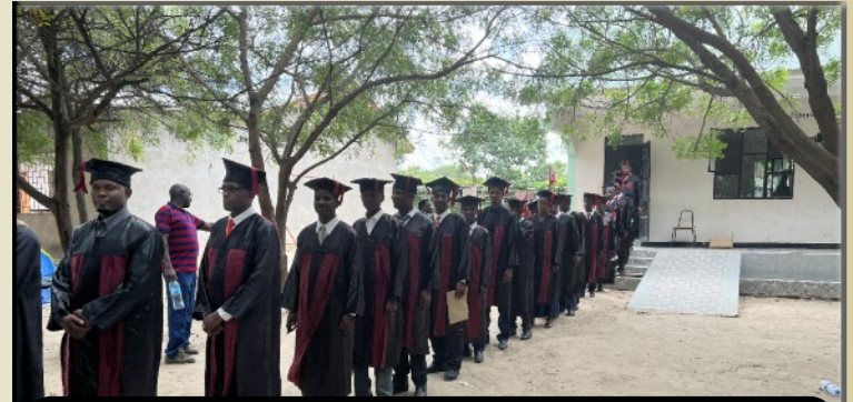
Students marching from the classroom to the church for their graduation.

It took us time, but God gave us a good result. We are a considerably stronger ministry now, and 15 of the original students ended up graduating from 6 different classes at 4 different campuses. God did it! He took our errors and our shortcomings and brought about His will.