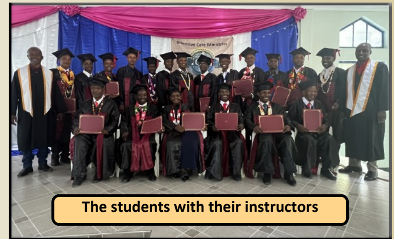
The students with their instructors

We are in the US until February 29th and would love to meet with as many supporters as possible. Our travel schedule is listed below, so if we are going to be in your area and you would like to see us, please try to attend the local event. If we don't see you this time, please know that we thank the Lord for each person and church who has partnered in the amazing work God is doing in Africa. And as always, we are anxiously waiting to see how and when He is going to answer our pleas for more help in the field.