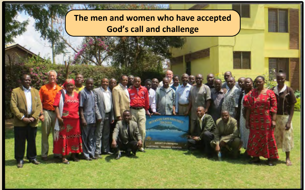
The men and women who have accepted God’s call and challenge

The Lord, however, had already identified the ministers He would add to our team several years ago. With a 3-5 year backlog of pastoral training center student candidates, we pushed, challenged, and tested the 35