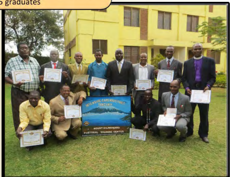
Bottom R: Class 5 graduates

Catch up on our personal journey through our website news, and find many more pictures there.