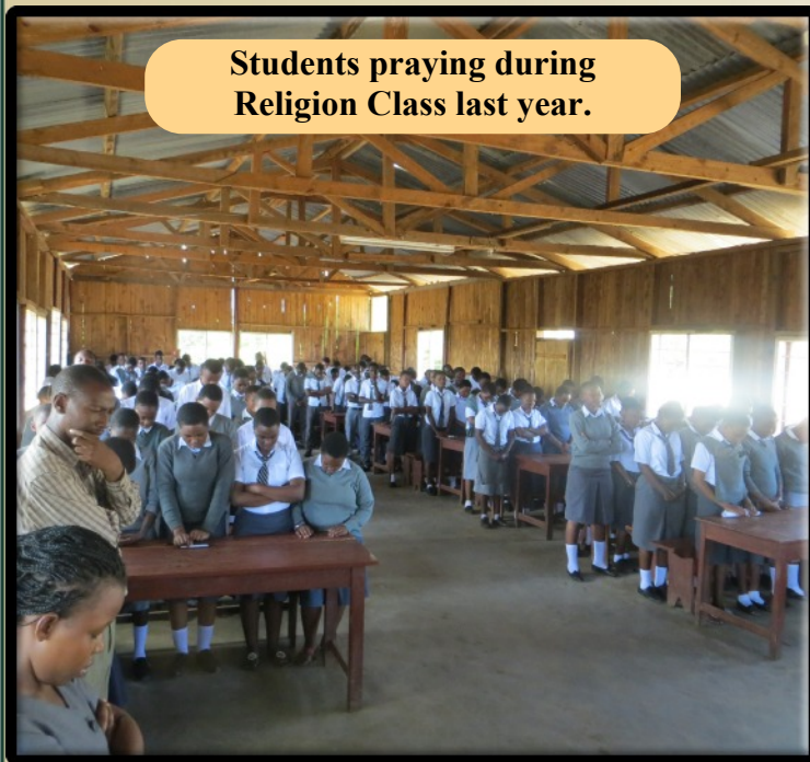
Students praying during Religion Class last year.

As with any new skill, we have found Inductive Bible Study (IBS) skills must be practiced and diligently worked out for them to fully develop and become a natural part of our life. This is a challenge we had to address in the original 3-day seminar program. We needed more time with the students, and our answer was to add two more seminar levels (Levels 3 and 4) to provide additional contact time with those who desire to work on their IBS skills further.