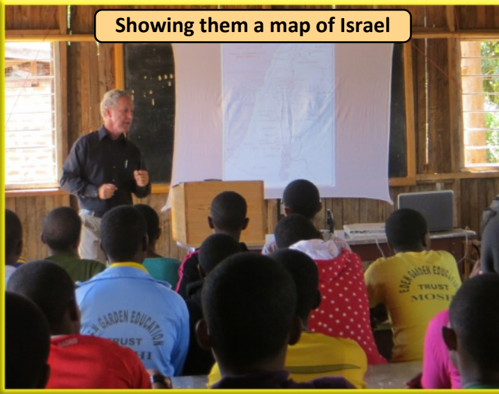
Showing them a map of Israel

followed by inductive teaching of the Word. Our initial study is going verse by verse through the Gospel of Mark which will take us a year. What we are already seeing is amazing. The students are grasping the IBS approach by seeing it in action through our Mark study. They are also opening up with us as well, realizing we have not fled after a year and are actually going to stay around for a while!