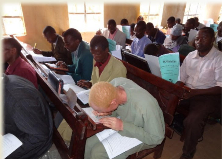
The various levels of discipleship teaching are well attended all across the country.