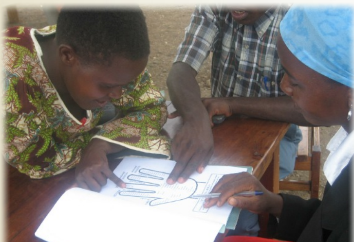
Learning the different classifications of the books of the Bible at an IBS seminar.

Your continued prayers and support are helping us do God's work in God's way to God's glory!