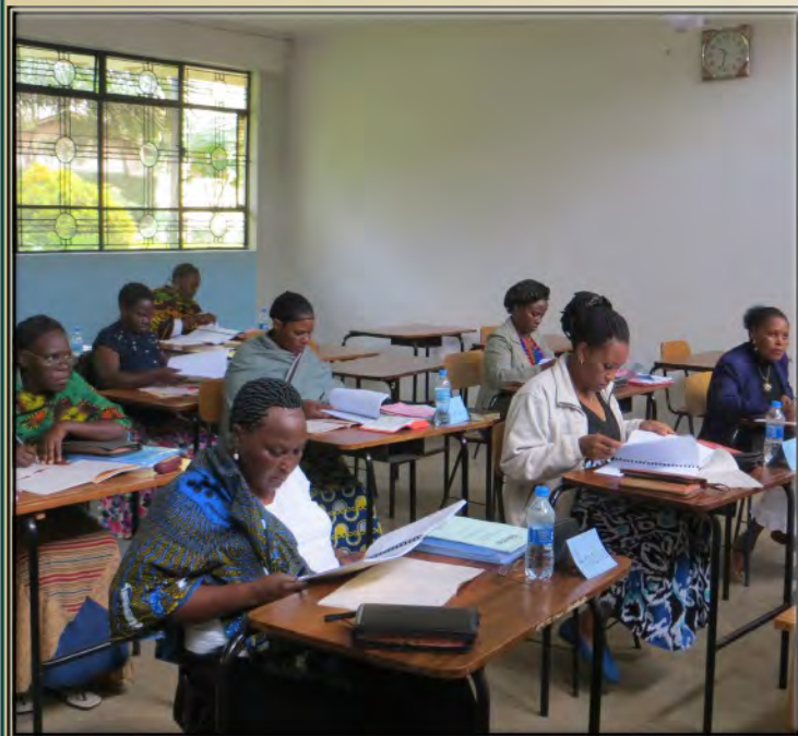
Top: Students during class time